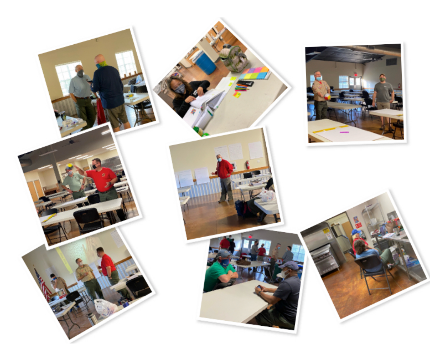
Your Wood Badge Staff Working Hard!